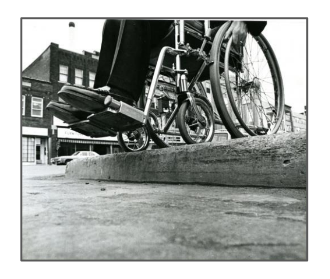
The Curb Cut Effect, a talk by me